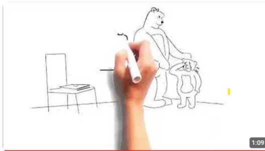
Parenting Styles, Part III: The Gottman Model

Introducing parenting styles (click image for video)